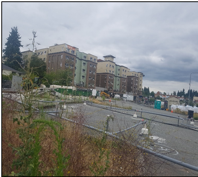
View of the Bothell Service Center Site