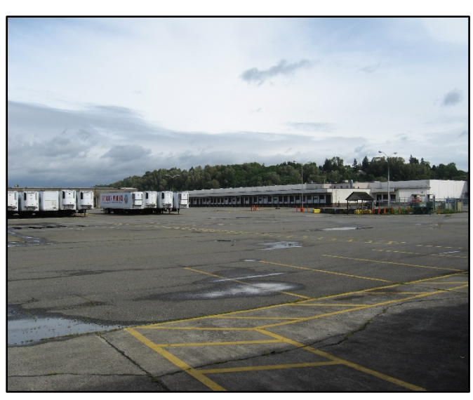
View of the Emerald Gateway Site