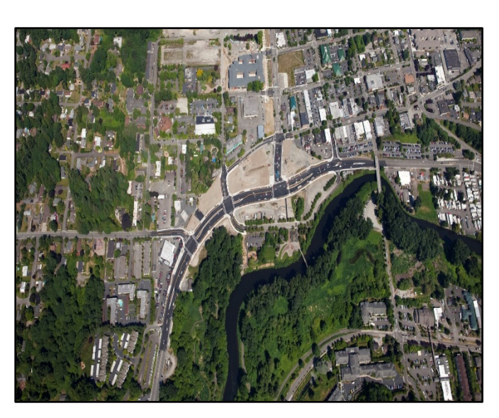
Bothell Riverside Site & surrounding area