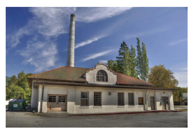
Power House Building, Summer 2017

• Draft Cleanup Action Plan (CAP): Uses information in the RI and FS to identify a preferred cleanup action and a schedule to remediate the contamination.