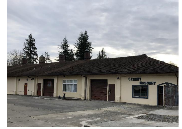
Former Laundry Building, January 2019

Contaminant levels within the Site are present at potentially harmful levels and must be addressed under the MTCA.