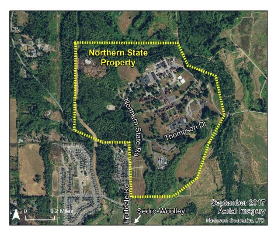
Aerial view of Northern State property, September 2017

In 2015 the City of Sedro-Woolley (City) annexed the Northern State property within city limits. In 2018 Washington State transferred ownership of the Northern State property to the Port. Many of the property's buildings are currently leased to tenants. The Port, City, and Skagit County are partnering on reuse of the property as the Sedro-Woolley Innovation for Tomorrow Center or SWIFT Center, a mixed use campus focused on technology and innovation.