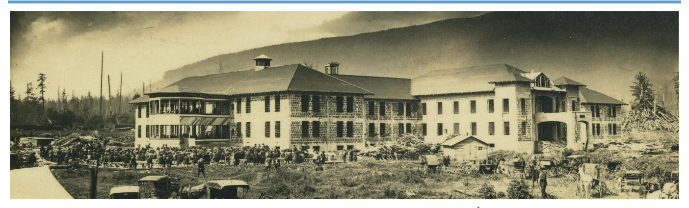
Northern State Hospital dedication, May 1912<sup>1</sup>