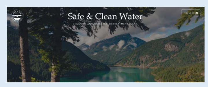
City of Anacortes Safe & Clean Water website: www.safeandcleanwater.com