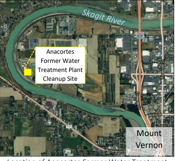
Location of Anacortes Former Water Treatment Plant next to the Skagit River in Mount Vernon, WA