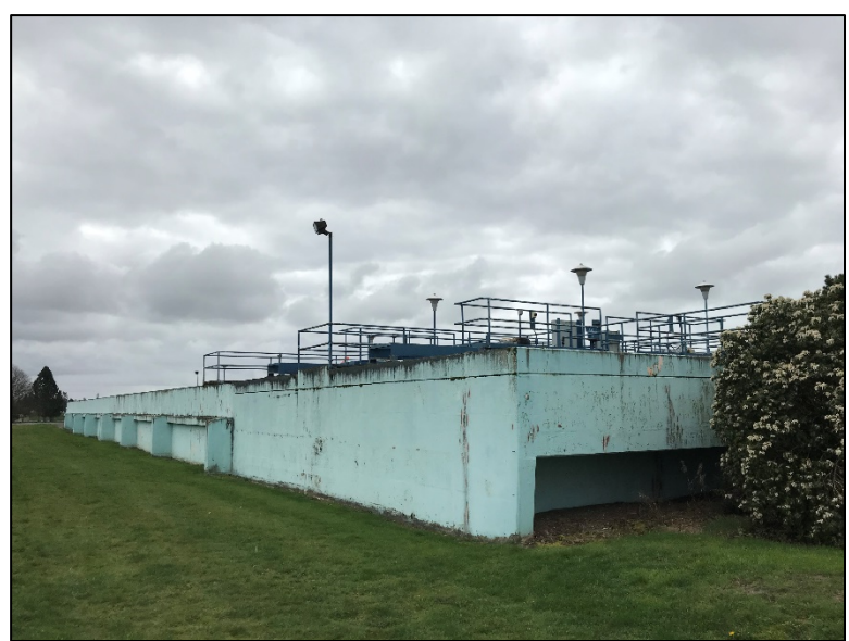
Decommissioned Sedimentation Basin facing south, March 2018

• Groundwater and surface water: The field sampling confirmed that there was no indication of PCBs released to surface water or groundwater.