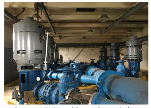
Decommissioned Pump Room below Administration Building, March 2018