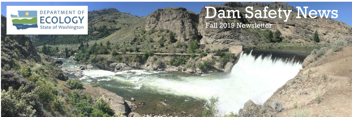
Enloe Dam flowing at 2,660 cubic feet per second