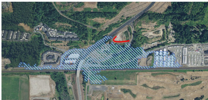
Inundated area (shown in blue) from a modelled dam breach (dam shown in red) in Pierce County, WA.