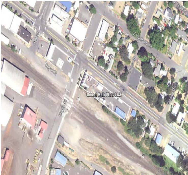
Map courtesy of Unocal Bulk Plant 0046 Agreed Order