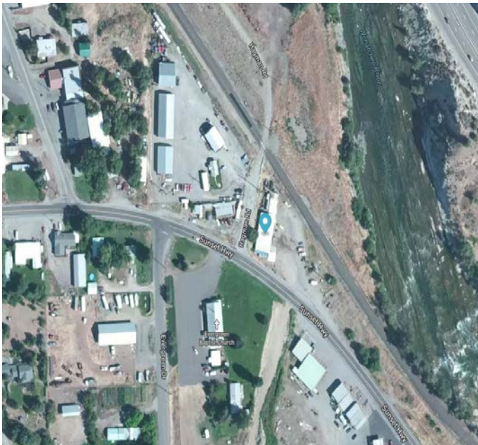
Map courtesy of New Earth Maps