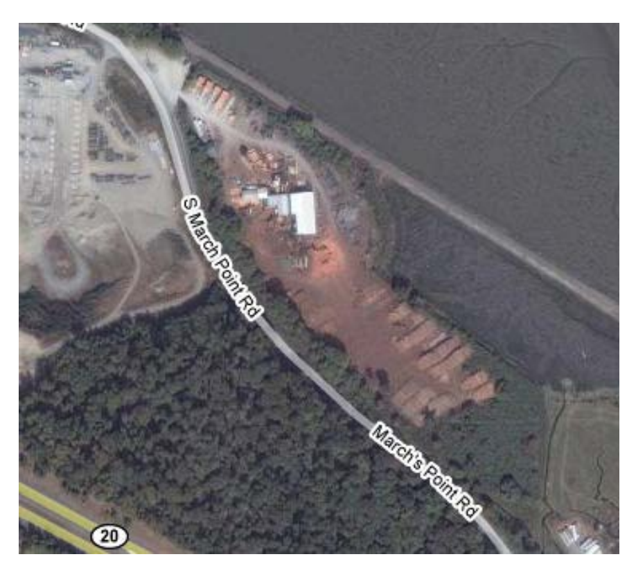
Figure 1 : The March Point Landfill Site is shown in the above map, located at 9663 South March Point Road in Anacortes, WA.

The Site is located at March Point Landfill in Anacortes, Skagit County, Washington, on Fidalgo/Padilla Bays (see Figure 1). The Site, approximately 14 acres of upland area, is located on the east side of March Point, north of South March Point Road at the base of a bluff in the tidelands area of Padilla Bay.