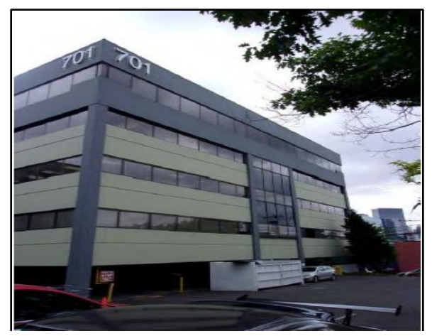
View of the 701 Dexter Cleanup Location