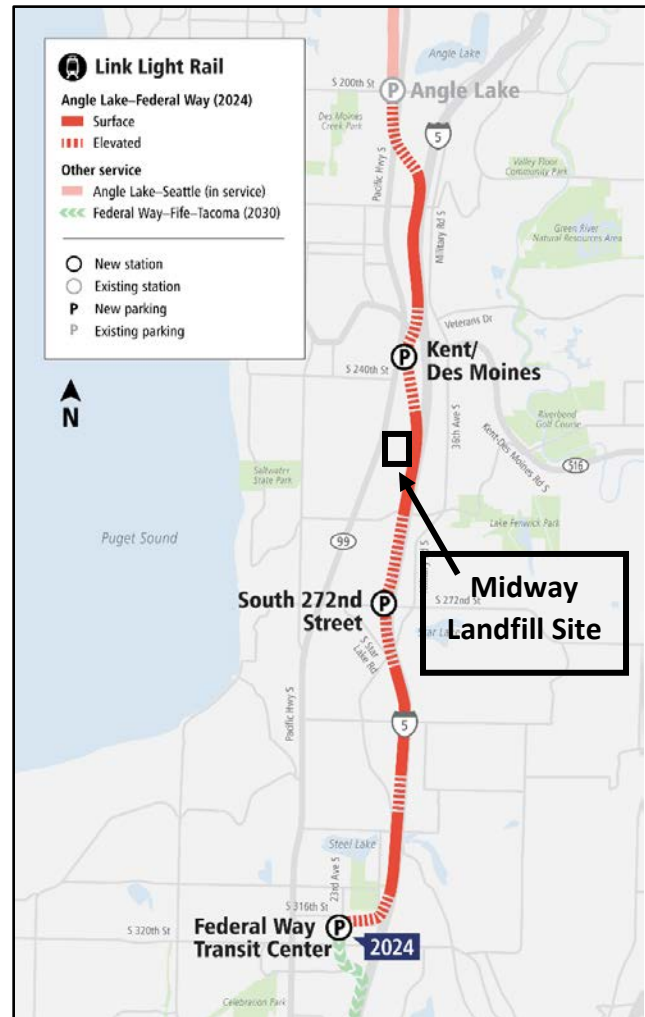
Sound Transit Federal Way Link Extension https://www.soundtransit.org/system-expansion/federal-way-link-extension

There is landfill material in the WSDOT ROW, and the City of Seattle will remove material as necessary to accommodate the WSDOT project. The City of Seattle, WSDOT, and Sound Transit believe that there are advantages to implementing a combined project that meets the needs of all three agencies and provides best value to the public. This scope of combined work is referred to as the “FWLE Midway Project.” The FWLE Midway Project contractor will remove enough landfill material for both the WSDOT’s lane widening work and for constructing a ground-level (at-grade) alignment for Sound Transit’s light rail.