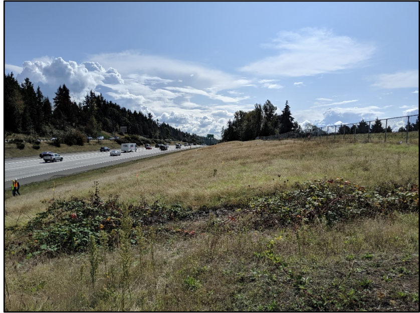
Midway Landfill and I-5 facing south