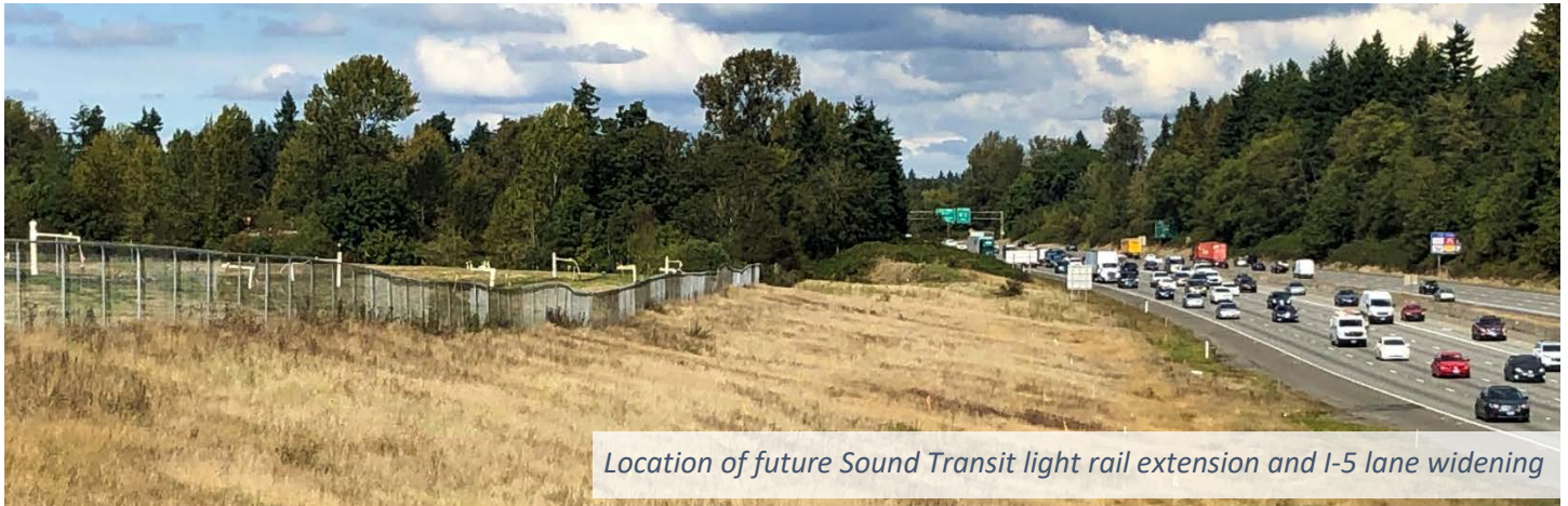
Location of future Sound Transit light rail extension and I-5 lane widening