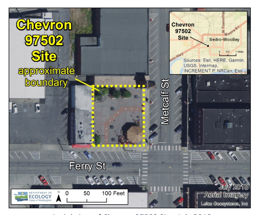
Aerial view of Chevron 97502 Site, July 2018

A gas station operated on the property from 1950 until 1991. Six underground storage tanks and three fuel pump islands were removed between 1991 and 1992 when the gas station was decommissioned.