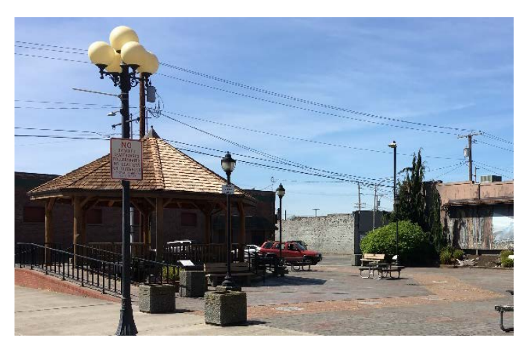
Hammer Heritage Park, May 2019

As a part of the Site's 1992 underground storage tank decommissioning, approximately 1,800 cubic vards of contaminated soil were removed from the Site. Testing in 2007 found light nonaqueous phase liquid (LNAPL or petroleum products that float on top of groundwater). Approximately 1,500 gallons of contaminated groundwater were removed by vacuum truck. A 2008 soil vapor investigation found soil vapor levels were below MTCA levels of concern. Groundwater was treated in 2009 and approximately 560 gallons of contaminated liquid were removed. Routine groundwater monitoring in 2013-2014 found that contaminated groundwater beneath the Site remains above MTCA cleanup levels established to protect human health and the environment.