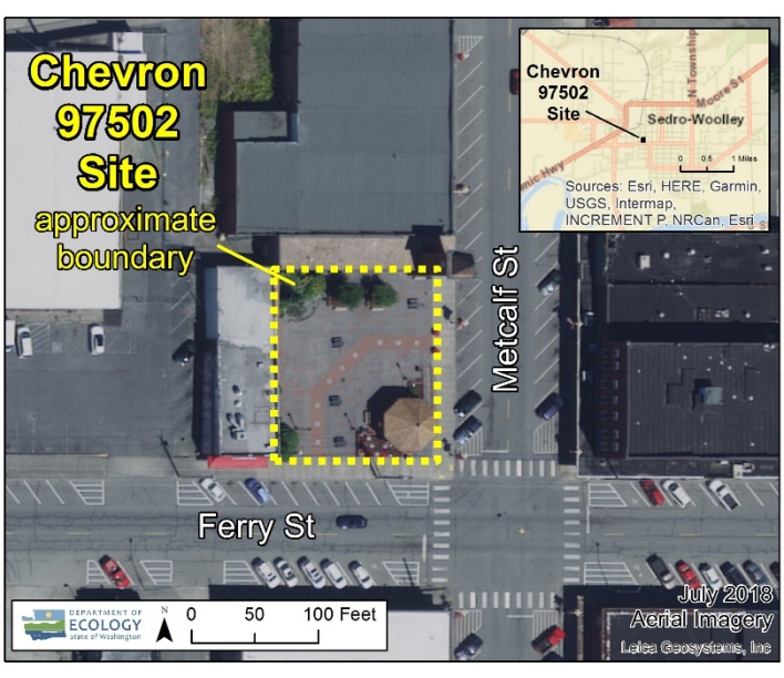
Aerial view of Chevron 97502 Site, July 2018