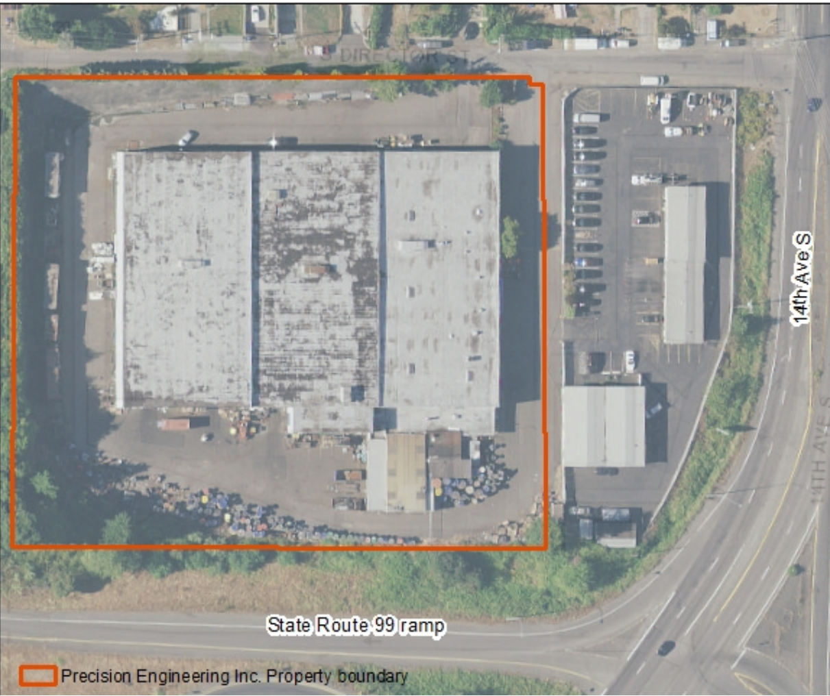
Aerial view of Precision Engineering Inc. Site.

Precision Engineering operated a heavy machining and equipment repair services shop at this location from 1968 through 2005. Activities there included grinding and polishing, honing, hard-chrome plating, milling, welding, and other flame and arc-applied metal coatings. This work involved the use of chemicals, particularly chromic acid for plating, and trichloroethene (TCE) as a solvent.