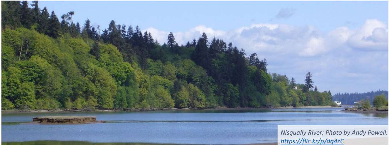
Nisqually River; Photo by Andy Powell, https://flic.kr/p/dq4zC