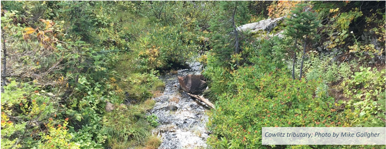
Cowlitz tributary