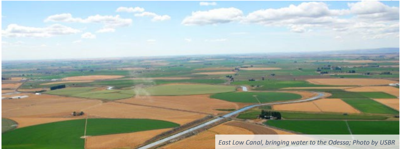
East Low Canal, bringing water to the Odessa; Photo by USBR