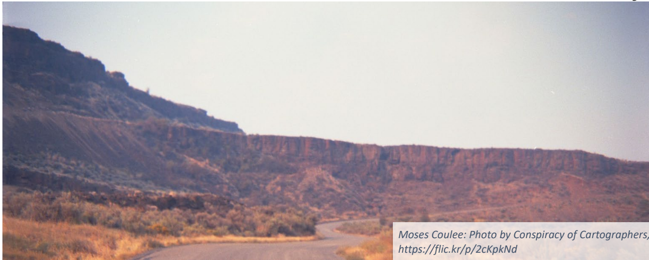
Moses Coulee: Photo by Conspiracy of Cartographers, https://flic.kr/p/2cKpkNd