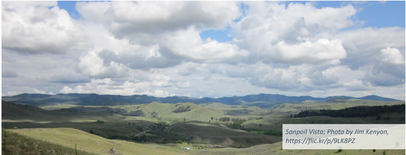
Sanpoil Vista