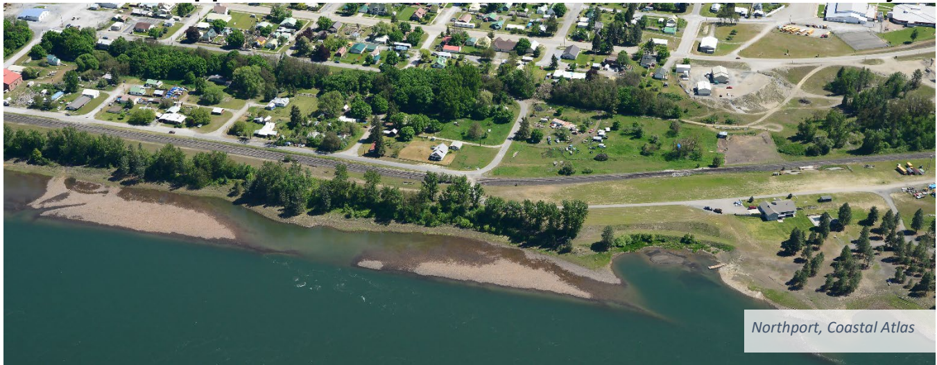
Northport, Coastal Atlas