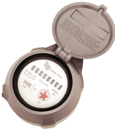
Figure 2. Badger High Resolution 8-dial Encoder