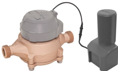
Figure 3. Badger Meter, Encoder, and Orion LTE Endpoint

If you are building a new home using a well within Kittitas County, your water meter is free and Kittitas County will reimburse you for the cost of installing the meter, up to $750, provided that: