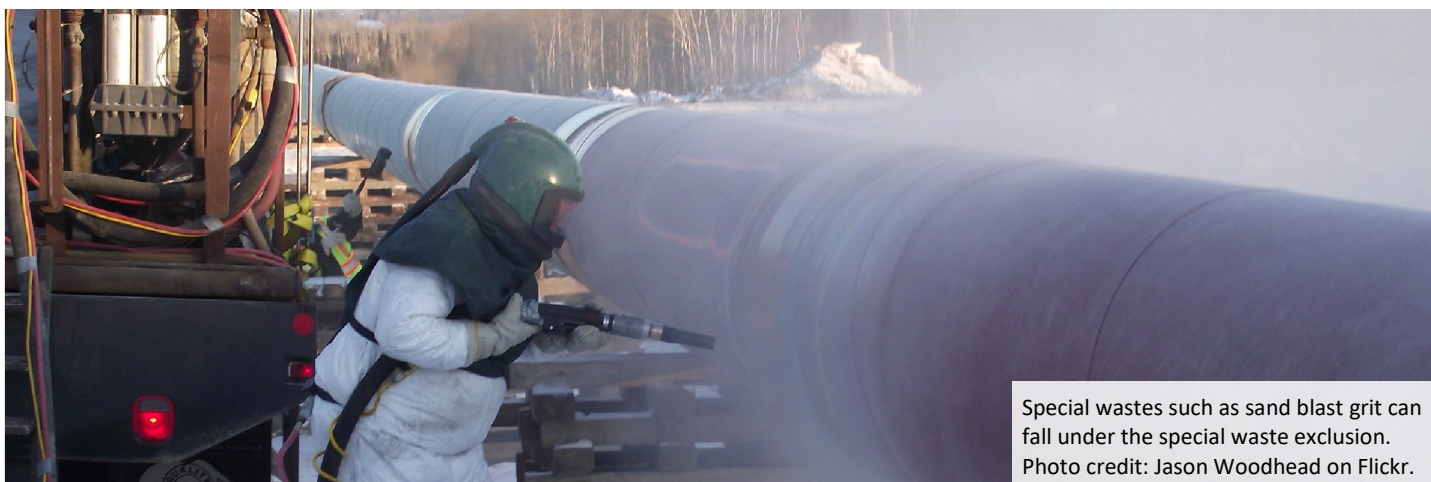
Special wastes such as sand blast grit can fall under the special waste exclusion.