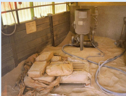
Figure 3: You must follow special waste requirements when managing waste from sandblasting.