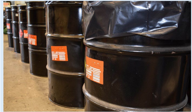
Figure 4: You must store special waste in a way that prevents releases to the environment.

If you are a facility receiving special waste for disposal, you must meet the requirements of WAC 173-351 20 and have an engineered liner. If the waste is disposed out of state, the receiving facility must meet the requirements of 40 CFR Part 258 or Part 270.