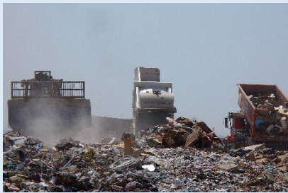
Figure 1: You may dispose of special waste in solid waste landfills permitted to accept it.