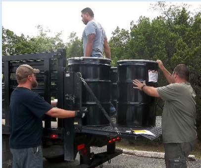
Figure 2: You may transport special waste off site on a bill of lading.