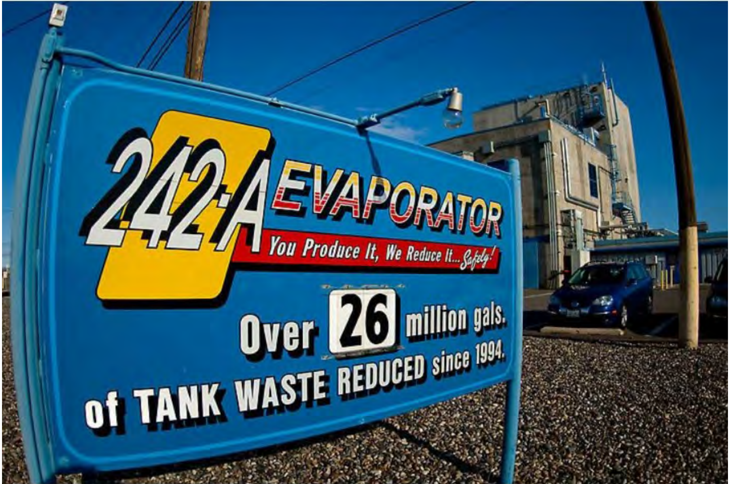
Figure 1 Sign in front of the 242-A Evaporator facility

modification are included. All deficiencies identified by Ecology have been resolved. The IQRPE design assessment provide information on the integrity of the tank system for the 242-A Evaporator associated with the wall penetrations.