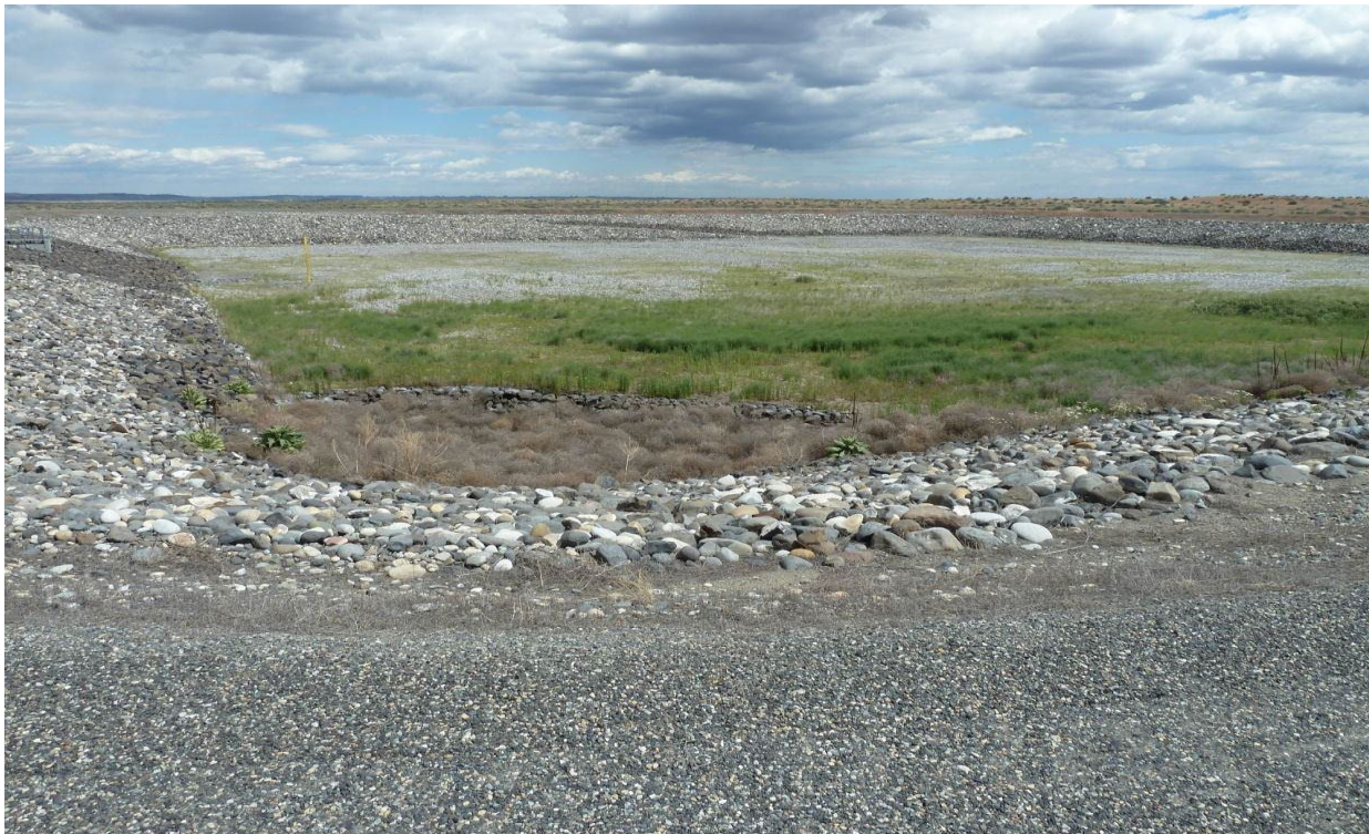
A Basin: 200 Area TEDF