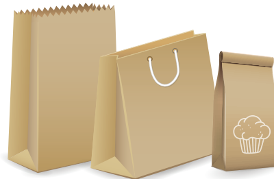
Small Paper Bags