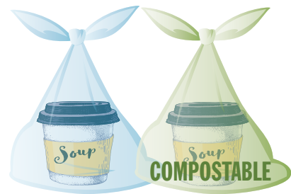
Small Bags for Moisture Control