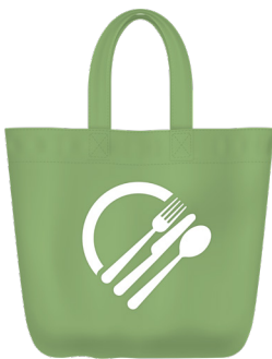
Clean Reusable Tote