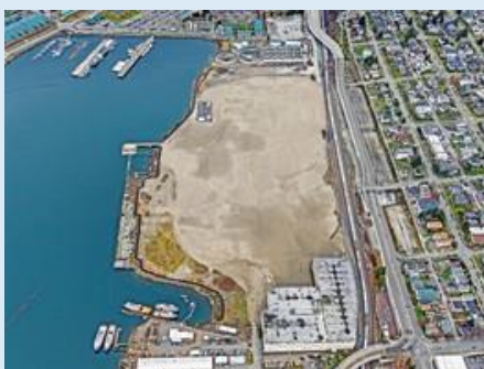
The site filled in with clean dirt and sand, one step in the cleanup process.