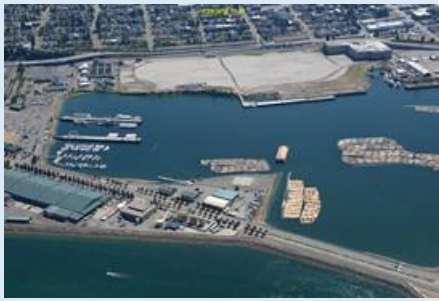
Port Gardner Bay shoreline after interim cleanup.