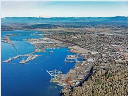
Looking north over Port Gardner Bay.