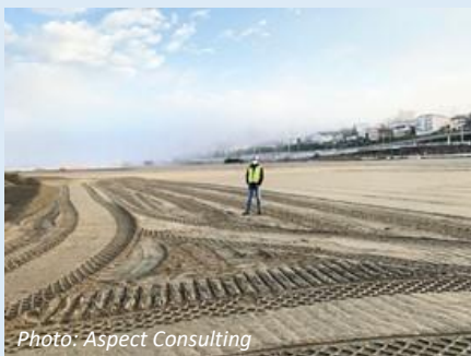
A worker stands on the site after interim action cleanup.