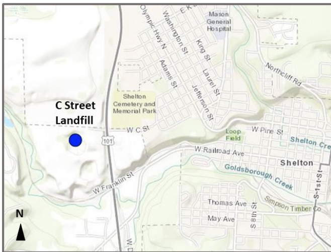
Figure 1. The landfill is southwest of the intersection of West C Street and US Highway 101.