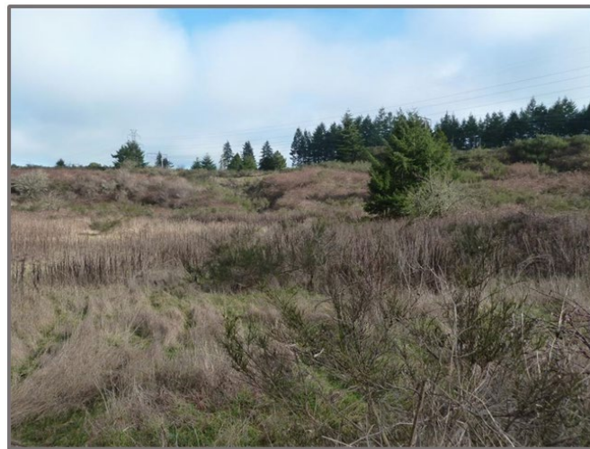
Figure 2. The property is vacant, undeveloped land covered by shrubs and trees.

The Site is a 16.7-acre property. Before 1928, the property was mined for sand and gravel. In 1928, the city purchased the property and began using it as a landfill until the mid-1980s. The waste is located in an area of about four acres on the property.