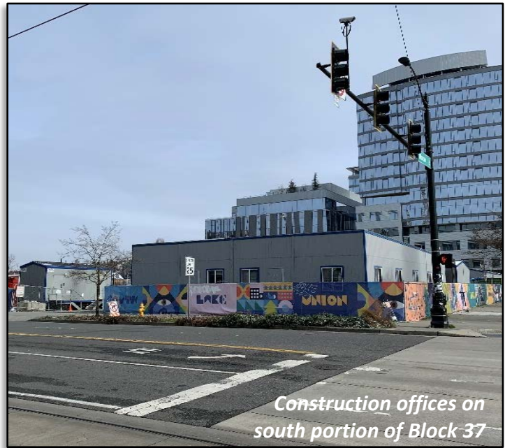
Construction offices on south portion of Block 37

Historical uses of the Property date back to the late 1800s. A lumber mill, creamery, and brewery operated there until the early 1930s. A railroad occupied the northeast corner from the 1910s to 2005. A retail gasoline service station operated on the northwest portion from about 1930 to the mid-1960s. A service garage operated on the northern portion from 1971 to 2002. A second retail gasoline and automobile service station operated on the southwest portion from about 1965 to 2008.