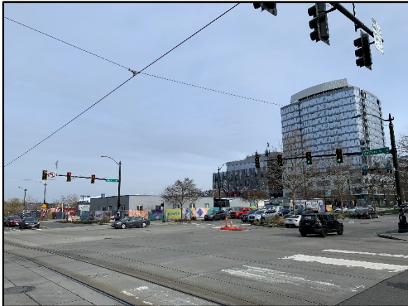
Northeast view of the Block 37 Cleanup Site