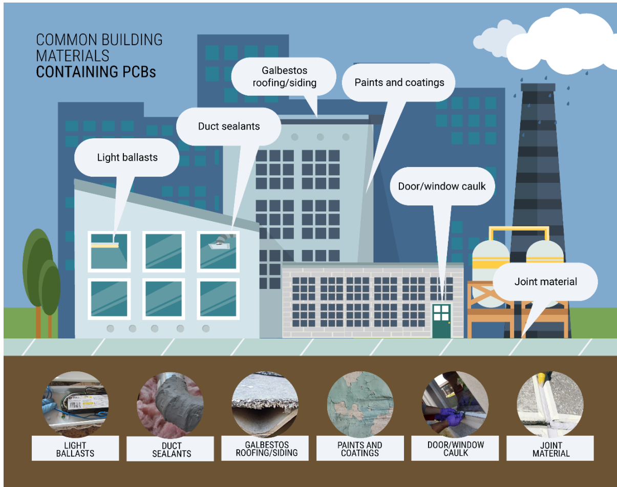
Figure 3: Examples of common building materials that contain PCBs.

These are additional common building materials that may contain PCBs: