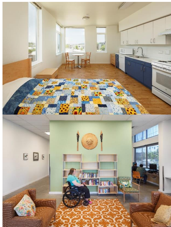
Figure 2. A studio apartment and the community room.