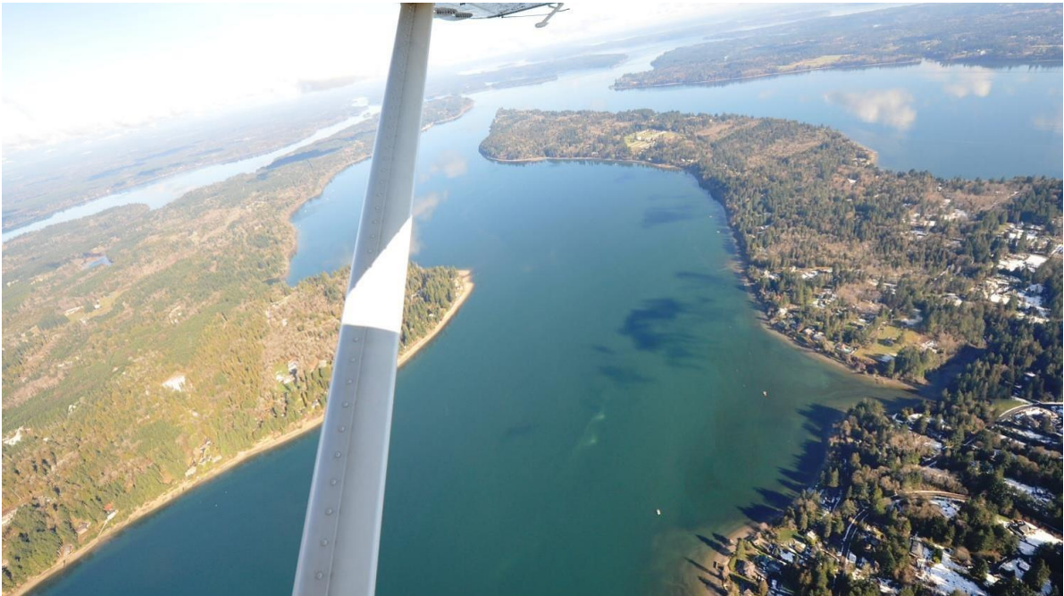
View of Eld Inlet, Cooper Point, and Budd Inlet from Ecology's Eyes Over Puget Sound flights.