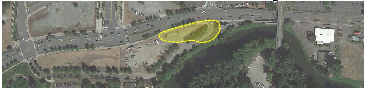
Bothell Riverside HVOC Cleanup Site