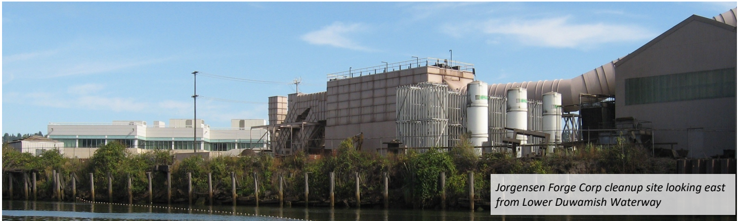
Jorgensen Forge Corp cleanup site looking east from Lower Duwamish Waterway