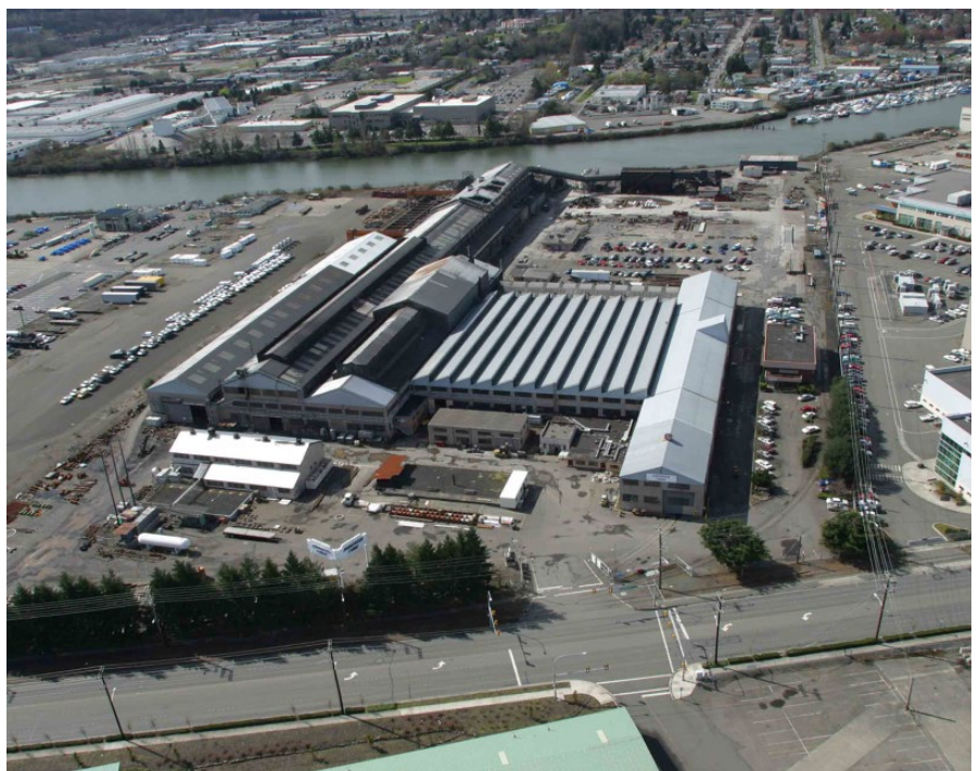
Aerial view of the Jorgensen Forge Corp site (looking west), present day.