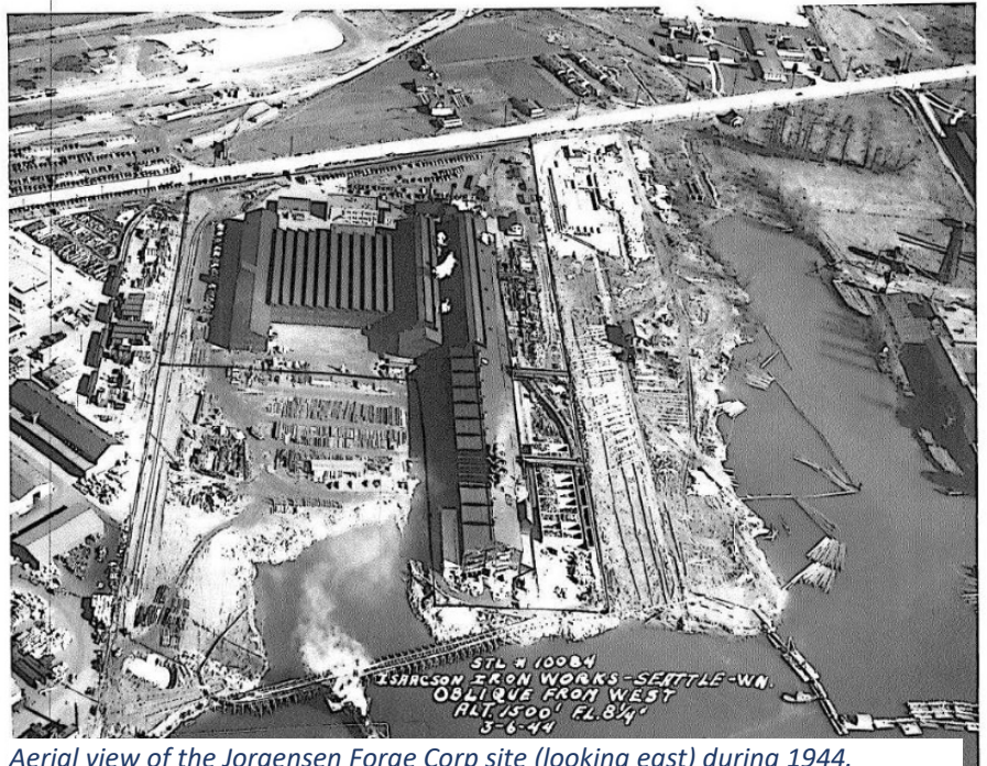
Aerial view of the Jorgensen Forge Corp site (looking east) during 1944.

All of these contaminants were found at levels above the state's cleanup law, the Model Toxics Control Act ( MTCA 1 ). MTCA requires these contaminants to be cleaned up.