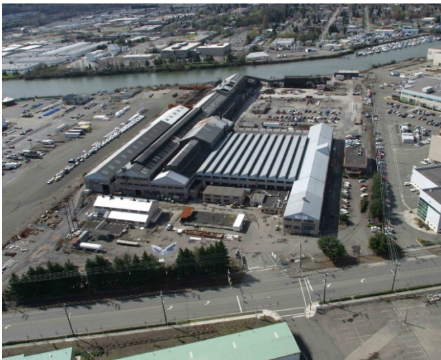
View of Jorgensen Forge Corp site, looking west