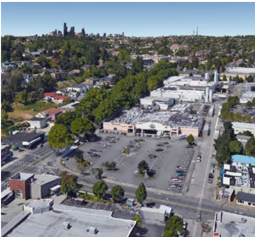
Aerial view of Rainier Mall Cleanup Site