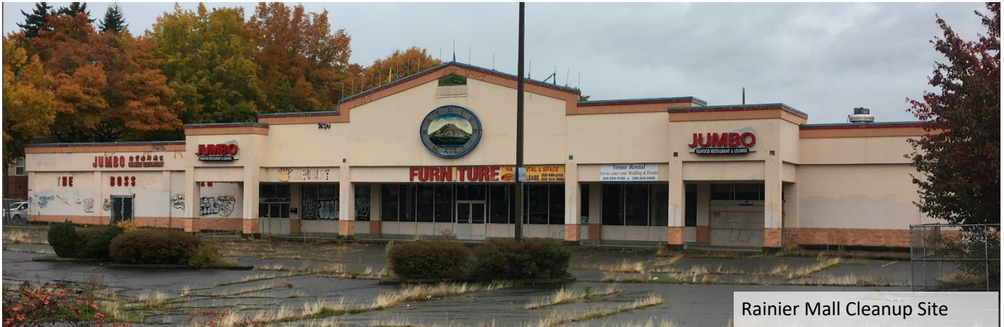
Rainier Mall Cleanup Site