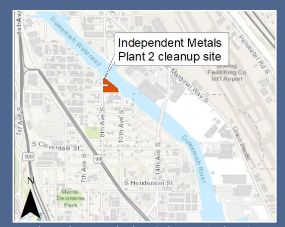
Independent Metals Plant 2 cleanup site location

Online public meeting – See Page 1 for details Wednesday, October 26, 2022; Starting at 6:30 pm; Register at: <a href="https://www.bit.ly/Ecology-IndependentMetals">www.bit.ly/Ecology-IndependentMetals</a>