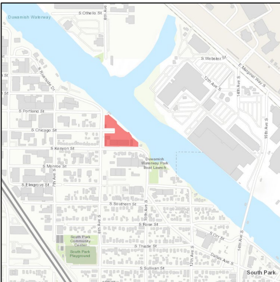
Aerial and map views of the Independent Metals Plant 2 cleanup site