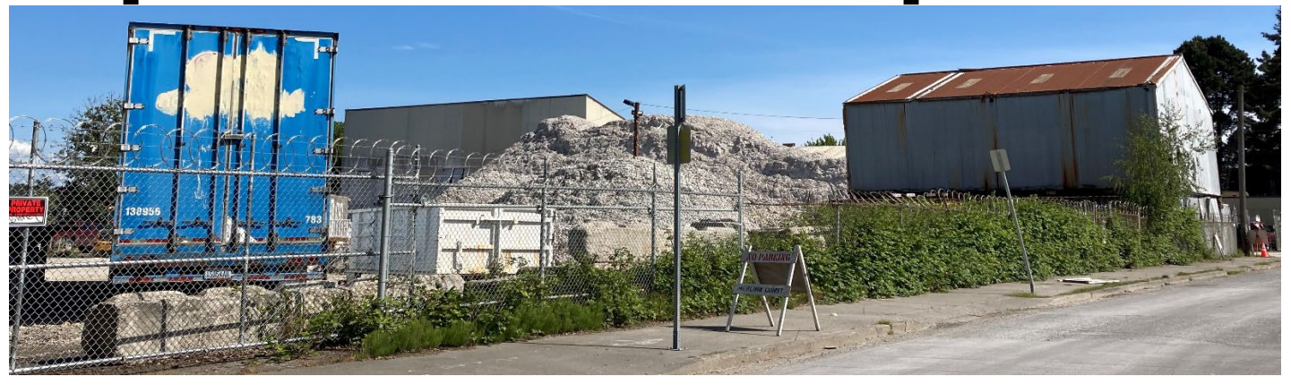
Northern portion of Independent Metals Plant 2 Cleanup Site