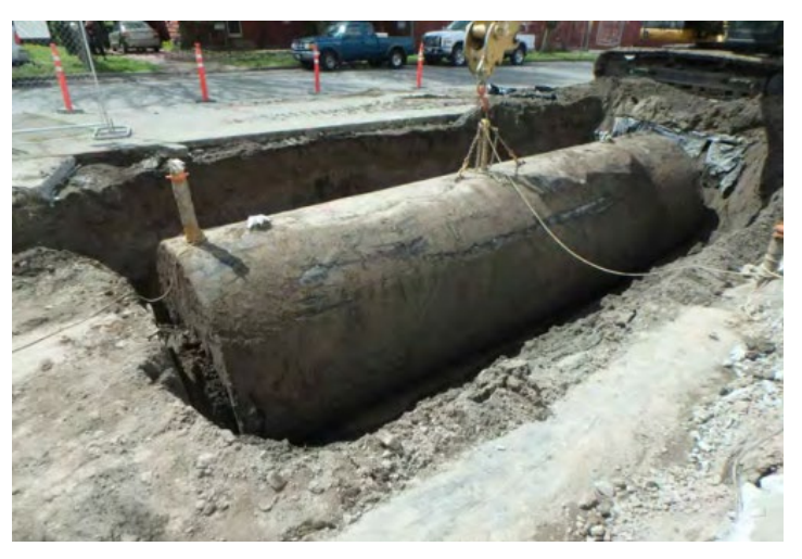
Underground storage tanks removed from the site