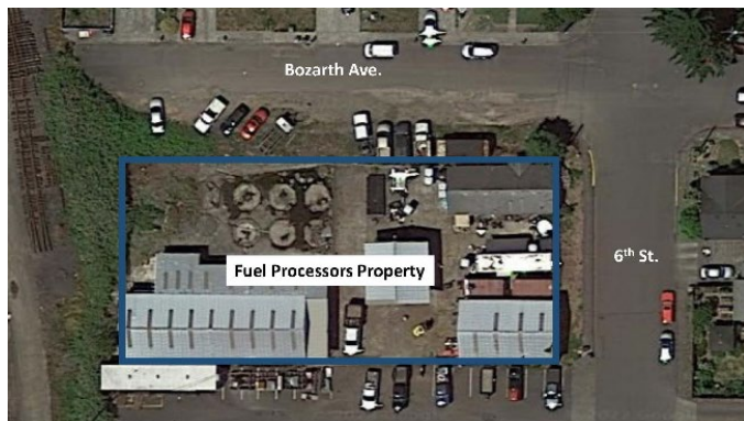
Figure 1: Location of the site at Bozarth Ave. and 6th St.