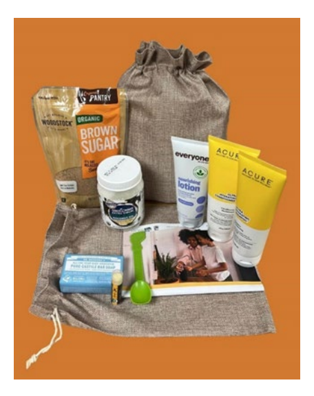
Figure 1: Safer self-care kit.

Participants who attended a workshop were given a gift card. Mother Africa used a log to inventory and track the gift cards. As an additional incentive and an educational tool, Mother Africa provided workshop participants with safer self-care kits containing personal care products. Each self-care kit contained the same products, which Ecology staff suggested as examples of safer options.