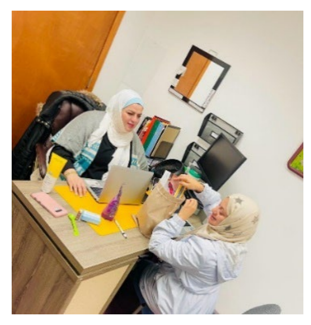
Figure 4: Mother Africa team preparing safer self-care products kits.

Based on feedback from Mother Africa, Ecology staff created a list of potential options for each type of product that would be included in the kit. Mother Africa staff and Ecology identified products that were available for purchase at a price that fit within the project budget.