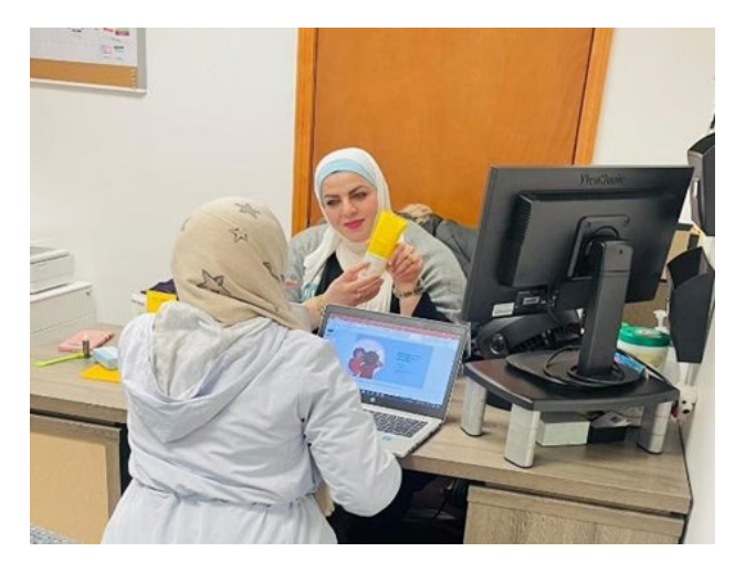
Figure 3: Mother Africa team during staff training.

Before the community workshops, the Safer Self-Care Coordinator delivered a safer self-care kit to each participant. Participants were asked to fill out a pre-workshop survey about their self-care product purchasing practices.