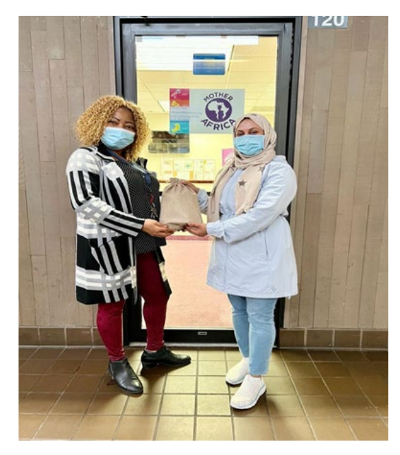
Figure 2: Delivering a safer personal care kit.

During the training, Mother Africa staff acquired technical knowledge about safer personal care products that they could share with their communities. Staff translators appreciated that Mother Africa and Ecology reviewed workshop materials during the staff training to prepare for the community workshops. Running the Mother Africa staff training before the community workshops helped the Ecology team practice answering questions and working with staff translators.