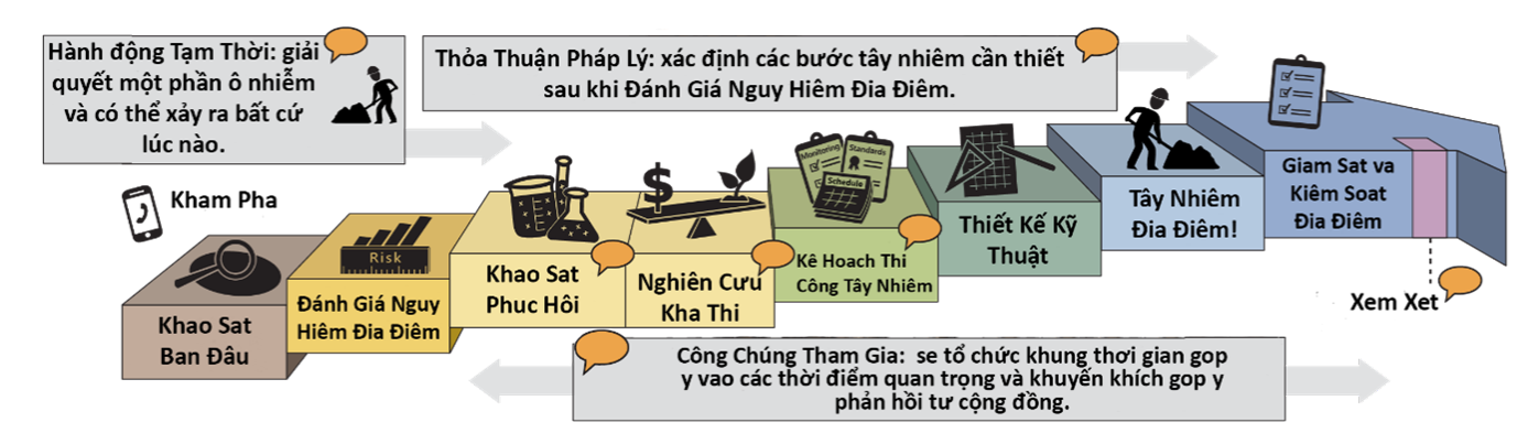
Figure 6. Formal cleanup process infographic (Vietnamese).