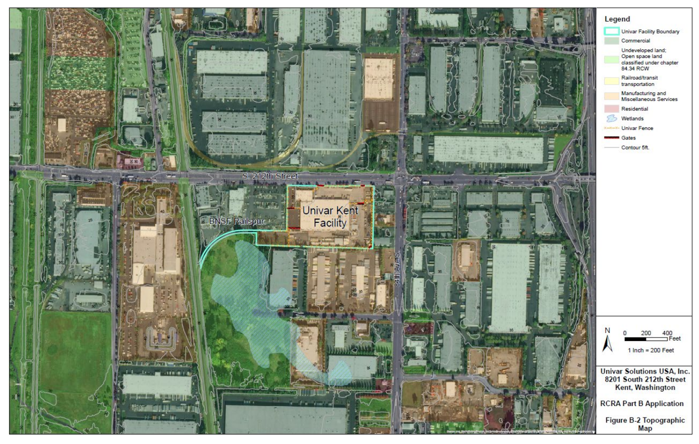
Figure 1: Topographic map of the Univar facility, located in Kent near the corner of South 212th Street and 84th Avenue South. The facility boundary is outlined in light blue.