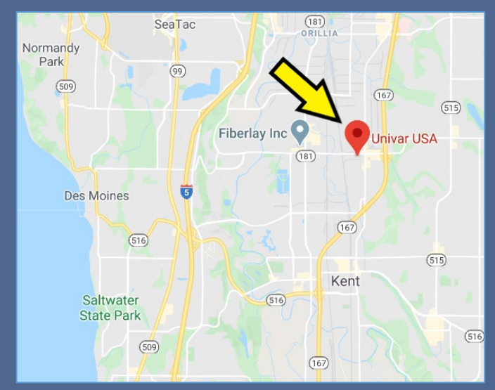
Google Map location of Univar in Kent, Washington.

ADA accessibility : To request an ADA accommodation, contact Ecology by phone at 360-407-6700 or email <a href="mailto:hwtrpubs@ecy.wa.gov">hwtrpubs@ecy.wa.gov</a>, or visit <a href="mailto:ecology.wa.gov/accessibility">ecology.wa.gov/accessibility</a>. For Relay Service or TTY call 711 or 877-833-6341.