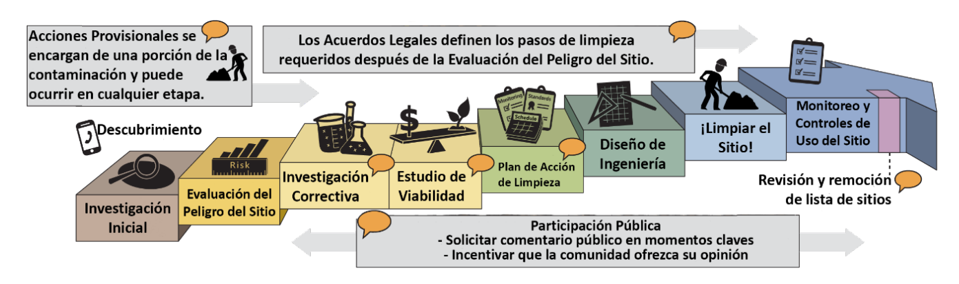
Figure 4: Formal cleanup process infographic (Spanish).