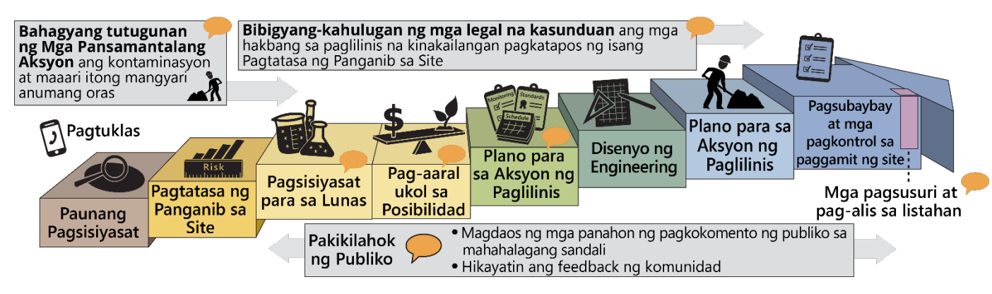
Figure 5. Formal cleanup process infographic (Tagalog).