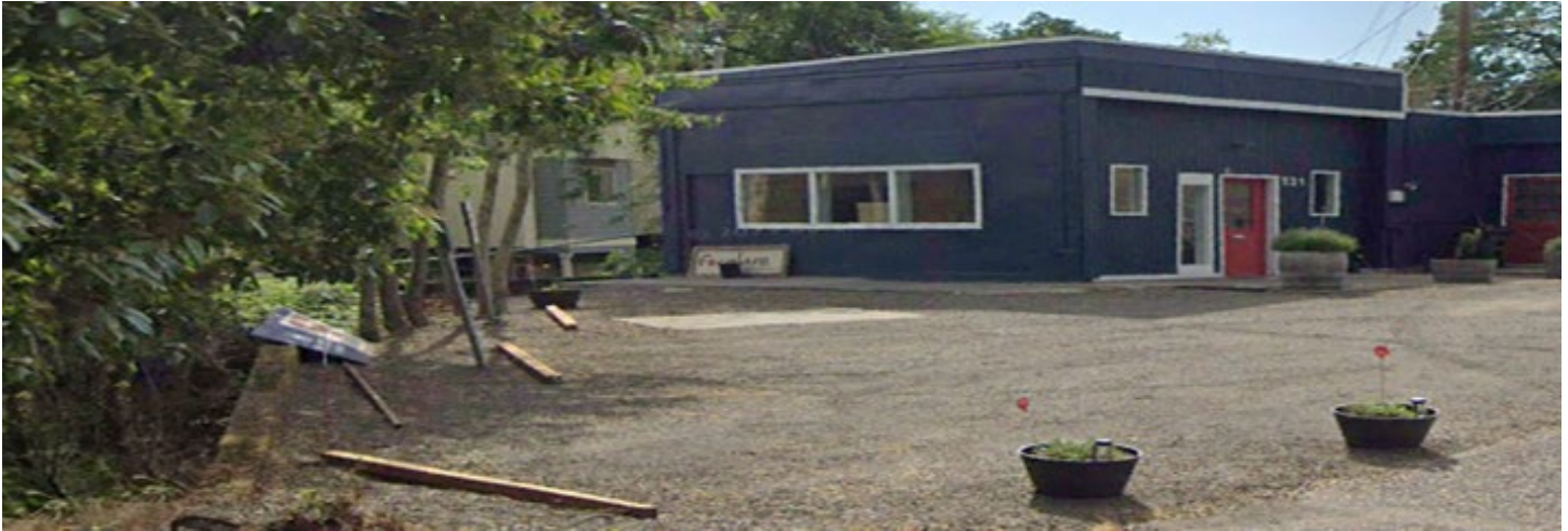
Town Pump Gas Station