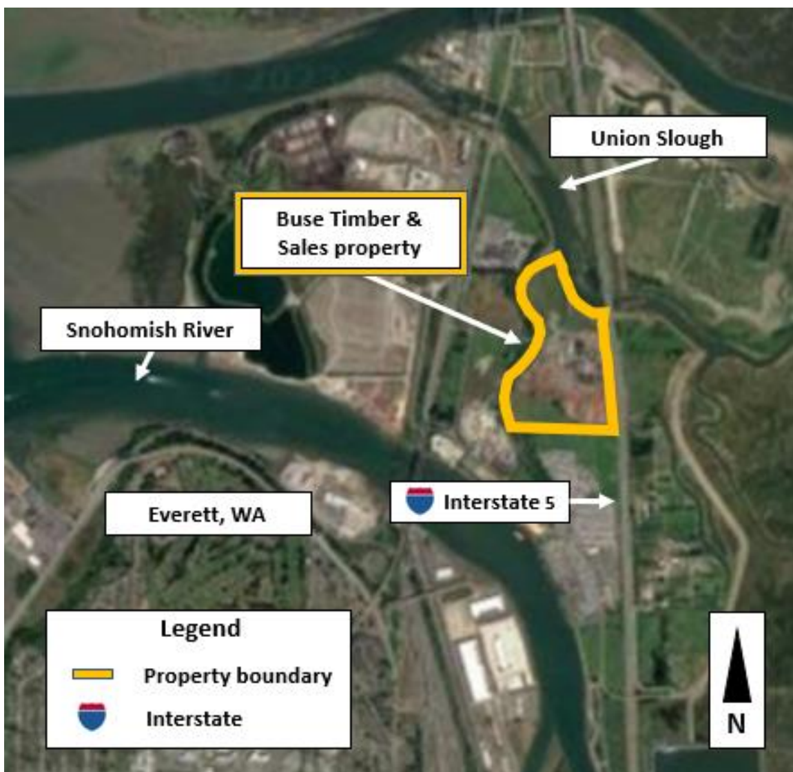
Figure 2: Map showing the location of the Buse Timber & Sales in Everett, Washington

You can find the draft Public Participation Plan and the draft Agreed Order in person at the Department of Ecology, and the Everett Library listed on the first page of this fact sheet. Or, you can view them and other project documents on the project website at: https://apps.ecology.wa.gov/cleanupsearch/site/4340#site-contaminants