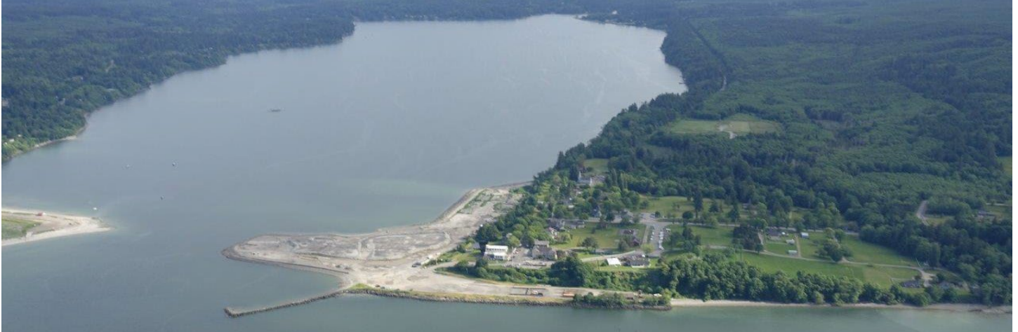
Figure 1. Aerial view of Port Gamble.