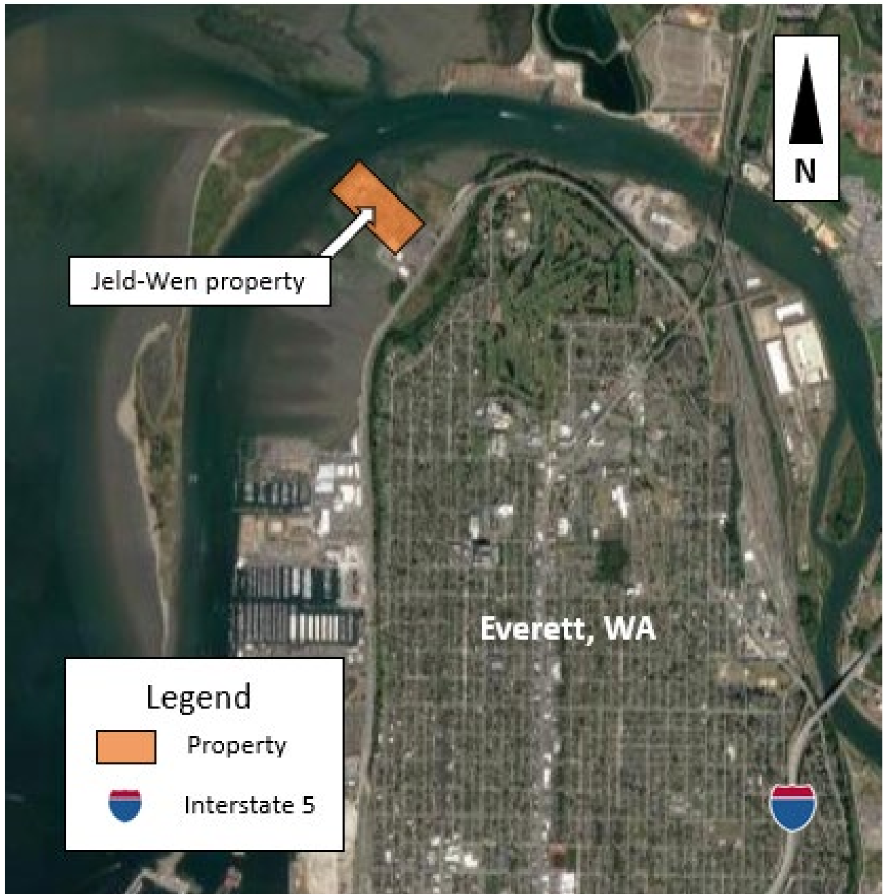
Figure 2: Map of the Jeld Wen site, showing areas of contamination identified in the Remedial Investigation and Feasibility Study.