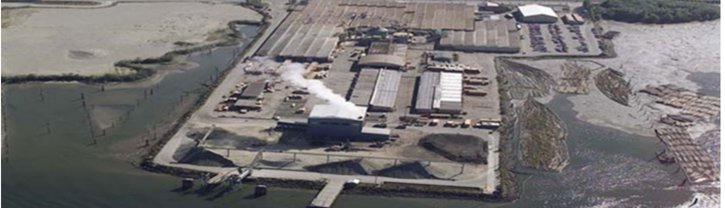
Aerial photo of Jeld Wen Cleanup Site