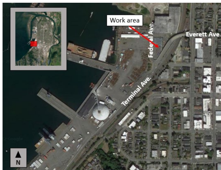
Figure 2: Map of project area

https://apps.ecology.wa.gov/cleanupsearch/site/5182 .