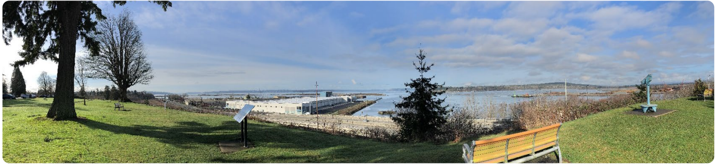
A view from the Hibulb Lookout looking west.