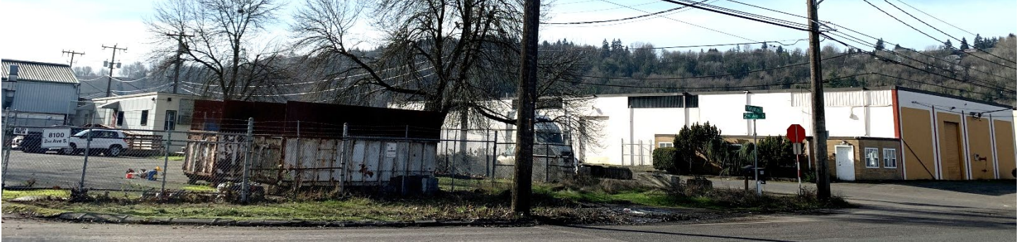
South Park Landfill Cleanup Site from S. Kenyon Street