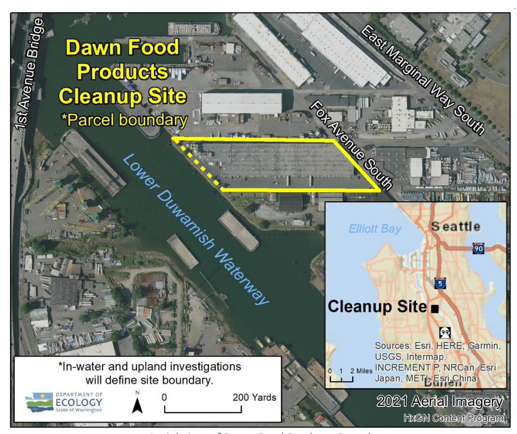
Aerial view of Dawn Food Products Parcel

Historical evidence indicates that the property has been used since at least 1917 for various commercial and industrial uses including