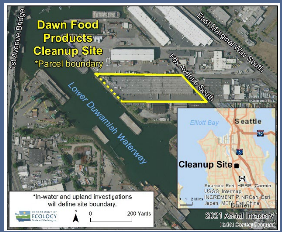
Aerial map of the Dawn Food Products cleanup site

To request an ADA accommodation, contact Ecology by phone at 425-533-5537 or email <a href="mailto:LDW@ecy.wa.gov">LDW@ecy.wa.gov</a>, or visit ecology.wa.gov/Accessibility. For Relay Service or TTY call 711 or 877-833-6341.