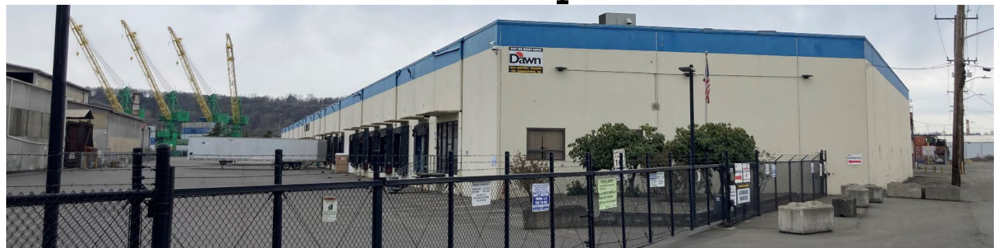
Dawn Food Products Main Building