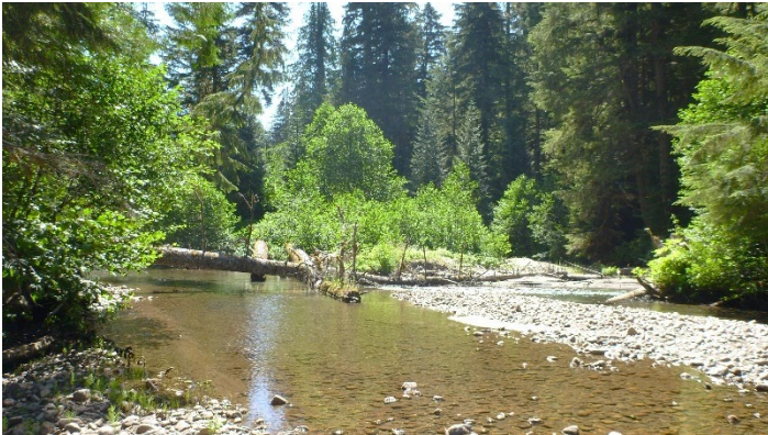
Figure 1. Green River.