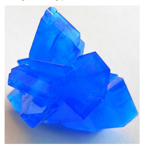
"<u>Copper sulfate.jpg</u>" by <u>Von Stephanb – Eigenes Werk</u>, used under <u>CC BY-SA 3.0</u>/Resized from original. No expressed or implied endorsement.

Copper sulfate pentahydrate (CuSP) (CAS# 7758-99-8) is a hydrated metal salt with a chemical formula of: Cu^{2+}SO_4 \cdot 5H_2O . Copper sulfate is an odorless blue crystal in pure solid-form, or blue powder when processed. Copper sulfate pentahydrate has a molecular weight of 249.66 g/mol. CuSP is highly soluble in water with a solubility of: 31.6 g/100mL @ 0° C, 203.3 g/100ml @ 100° C. 148 g/kg @ 0 C, 230.5 g/kg @ 25 C, 335 g/kg @ 50 C, 736 g/kg@ 100 C, >= 100mg/ml @ 70 F CuSP has a vapor pressure of 7.3mm Hg @25° C. Due to the higher than atmosphere vapor pressure CUSP is efflorescent and will spontaneously lose water (hydrated salt) forming a layer of anhydrous copper sulfate (Pubchem, 2022). CuSP has a pH that ranges from 3.7 -4.5. CuSP has a melting/freezing point of 110° C and a boiling point of 150° C (Chemical book, 2020).