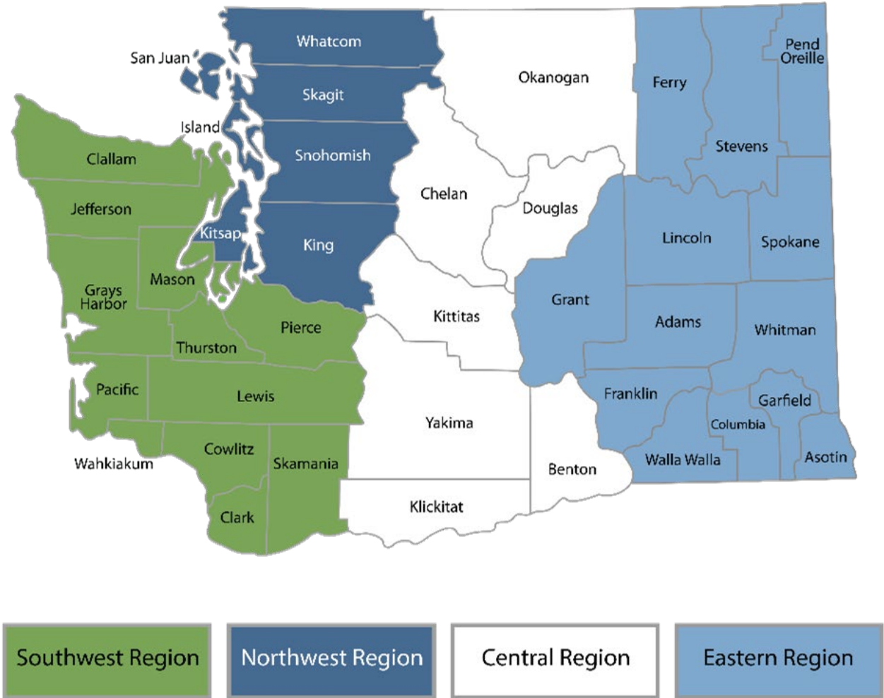
Figure 1. Map of counties served by region.