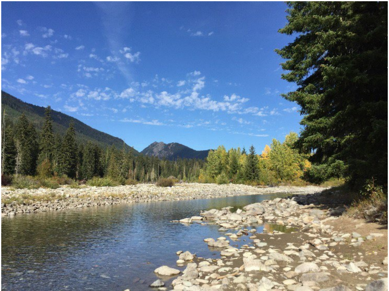
River flowing in a forest near the mountains.

The grant funding opportunity opens on January 2, 2024, and closes on February 29, 2024, at 5:00 p.m.