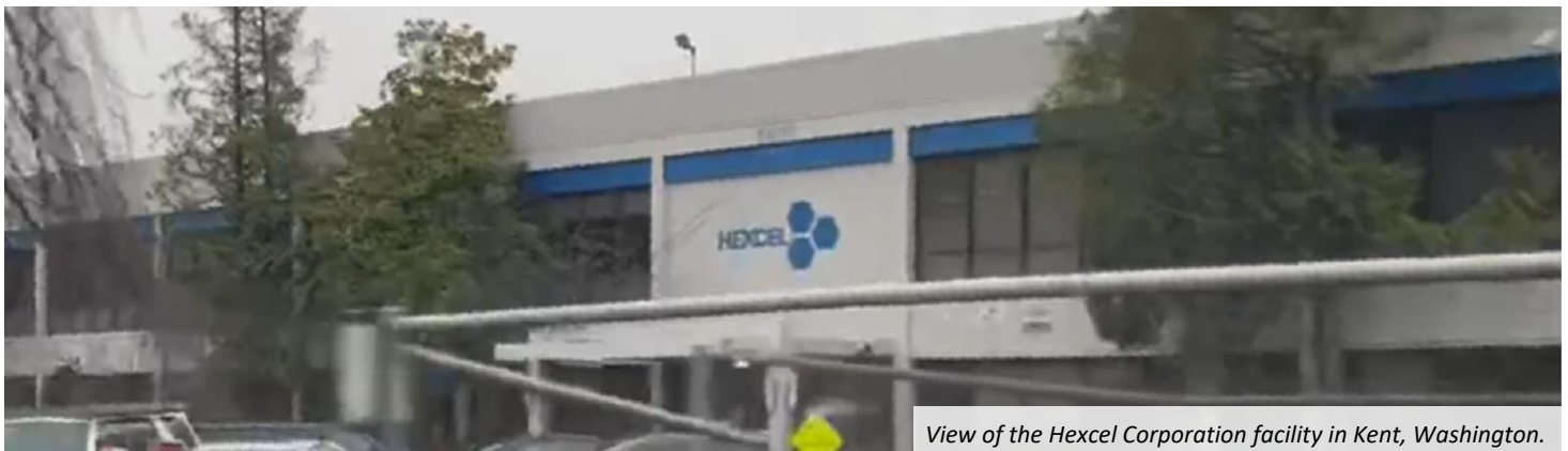
View of the Hexcel Corporation facility in Kent, Washington.