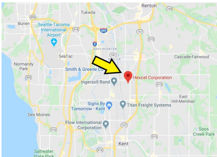
Map of Hexcel location in Kent, Washington.