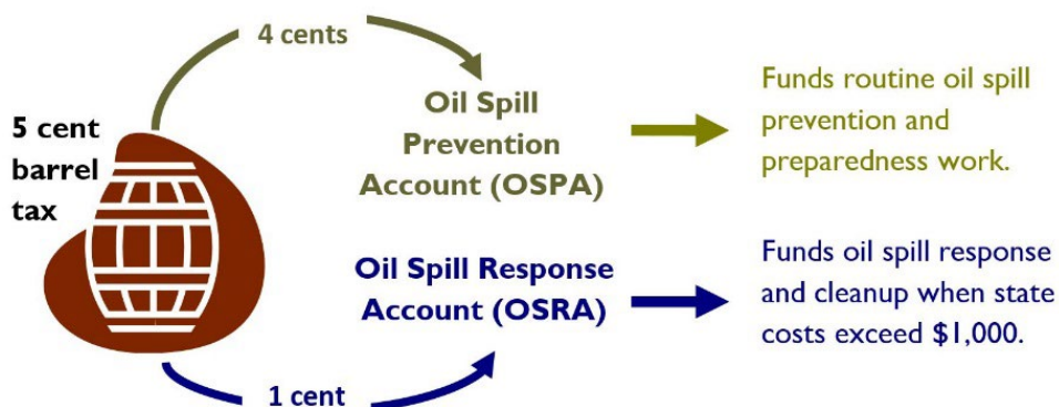
Figure 2: Barrel tax allocation

These two accounts are the Oil Spill Prevention Account (OSPA) and Oil Spill Response Account (OSRA). These accounts receive revenue from the Oil Spill Administration Tax and Oil Spill Response Tax (commonly known as the barrel tax). The barrel tax is five cents per barrel (42 gallons) of oil imported into the state by vessel, rail, and pipeline. Of this five cents per barrel tax, four cents goes into the OSPA and one cent goes into the OSRA. However, oil that leaves the state receives an export tax credit at an equal rate of five cents per barrel, and the credits are deducted in the same amounts from the OSPA and OSRA, respectively.