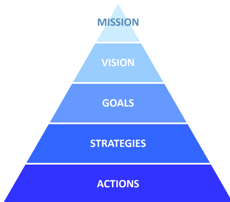
Figure 1: Strategic and program plan framework

The strategic and program plans are developed under a consistent framework, using the following operational definitions: